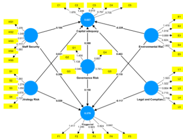
Figure Error! No text of specified style in document..2 Compliance-related risks model

All latent variable loading values exceeding 0.60 were included in the model (See Figure 3.2).